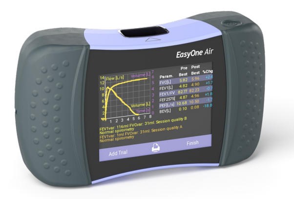
Incentive screens Available with EasyOne Connect software