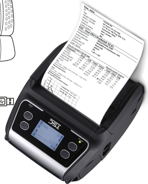
TSC Alpha 4L

Connect your EasyOne Air via USB to the thermoprinter.