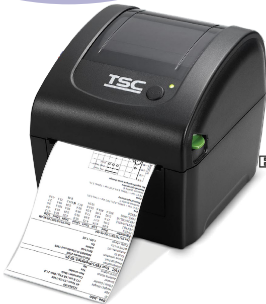
TSC DA 200